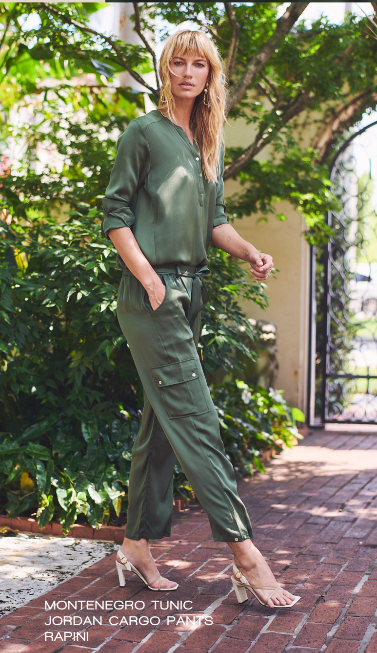
MONTENEGRO TUNIC JORDAN CARGO PANTS RAPINI