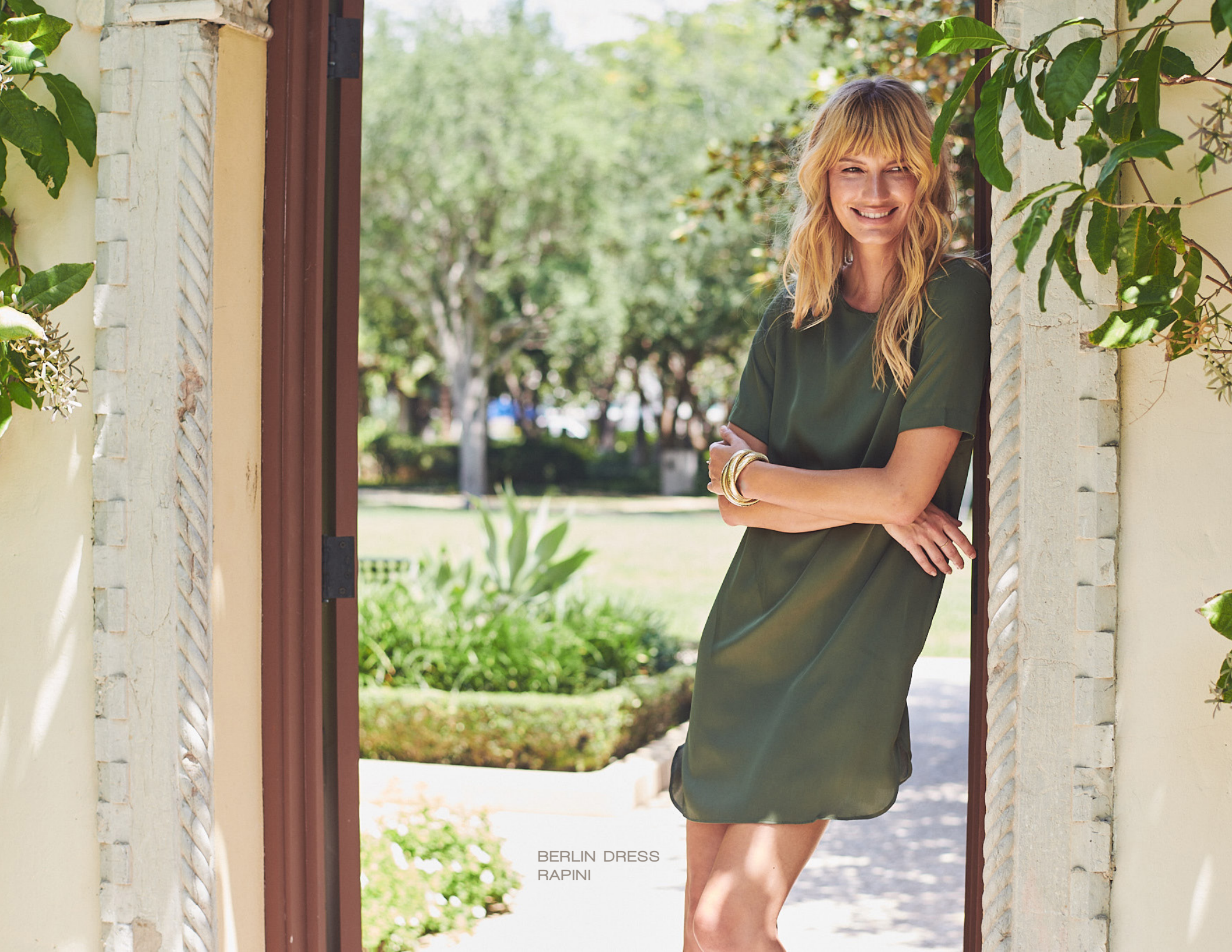
BERLIN DRESS RAPINI