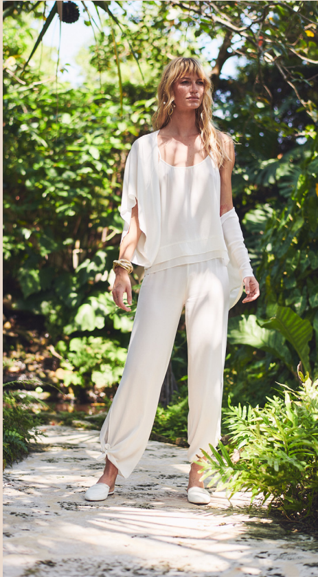
ROMA CAPE ZANZI CAMI PONDY PANTS NOUVELLE WHITE