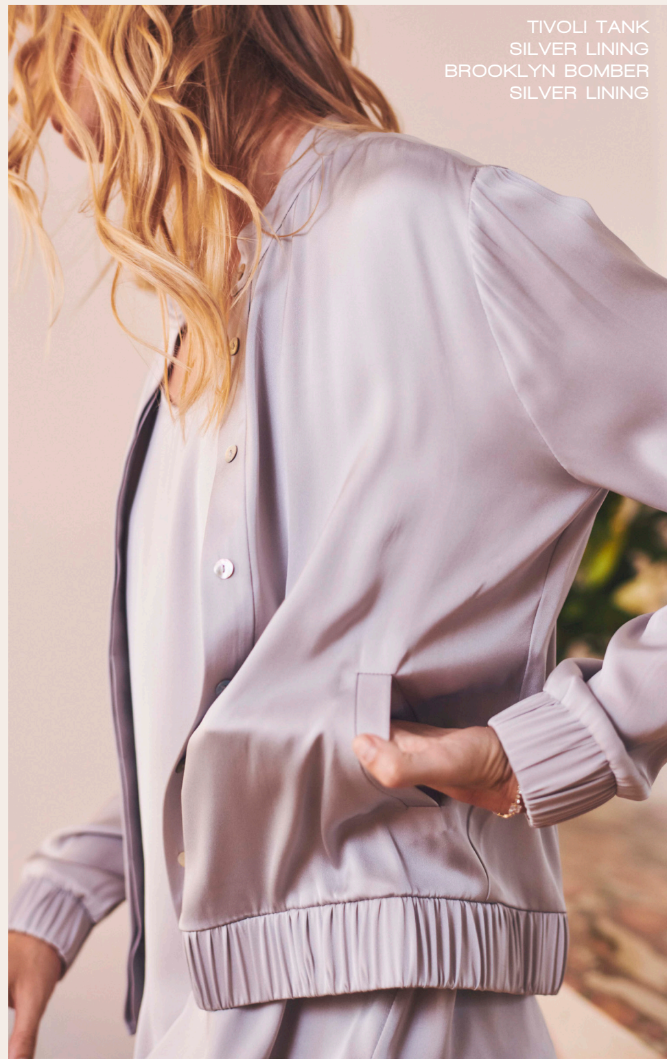
TIVOLI TANK SILVER LINING BROOKLYN BOMBER SILVER LINING